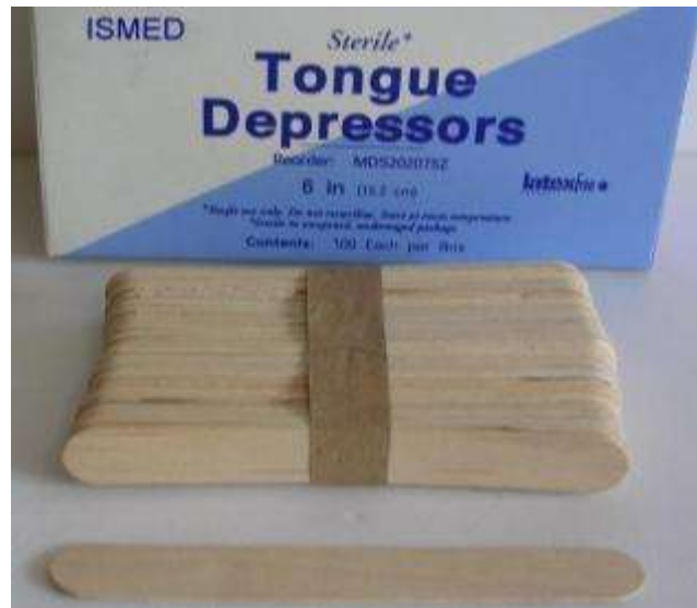
Figure 4: Disposable wooden spatulas