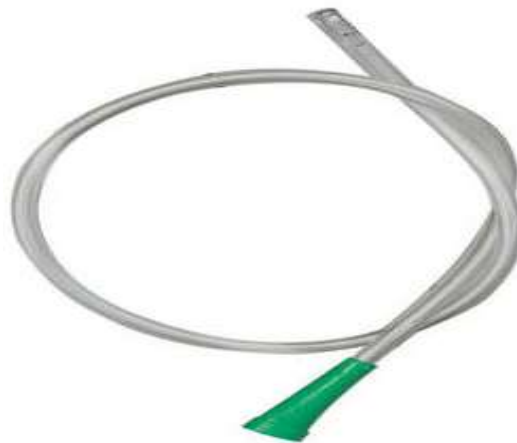
Figure 5:Soft suction catheter