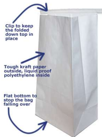
Figure 1: Motion sickness bags