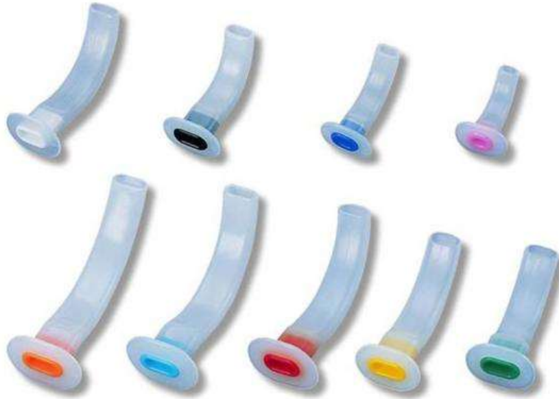
Figure 3: Oropharyngeal airways