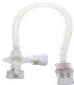
Figure 6: IV extension tubing