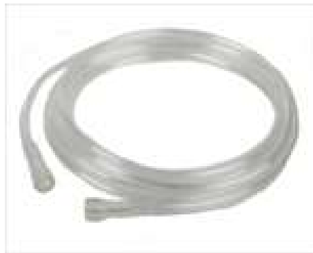
Figure 7: Oxygen extension tube