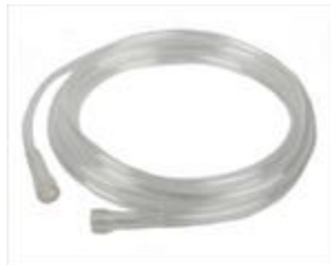
Figure 7: Oxygen extension tube