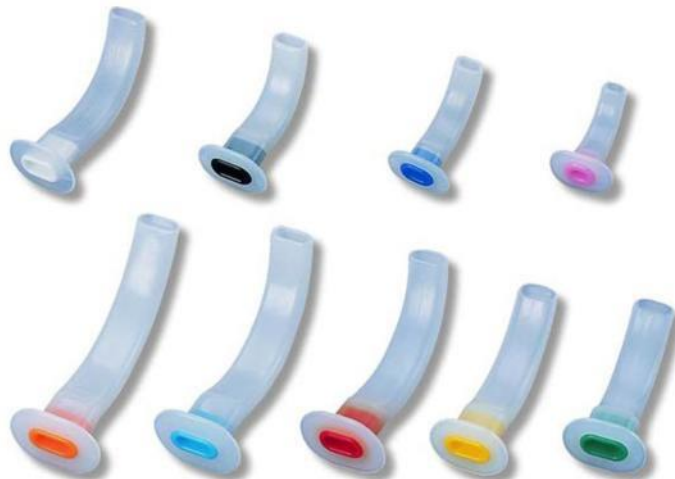
Figure 3: Oropharyngeal airways