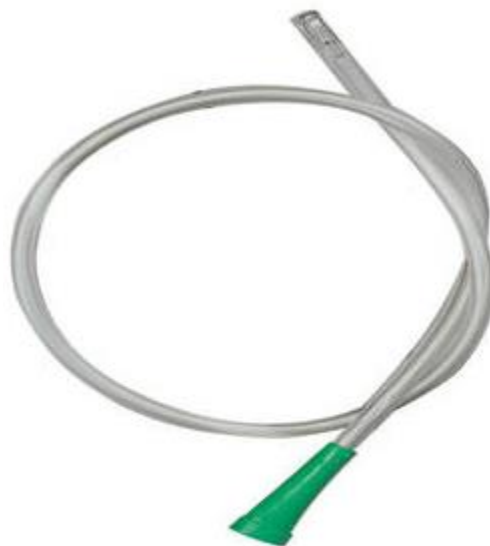
Figure 5:Soft suction catheter