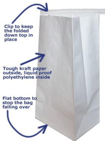
Figure 1: Motion sickness bags