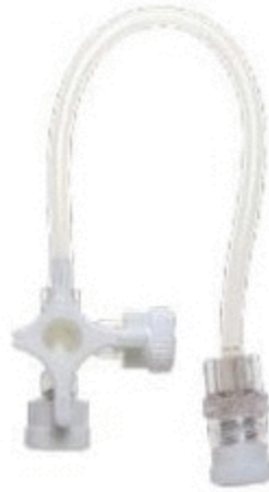
Figure 6: IV extension tubing