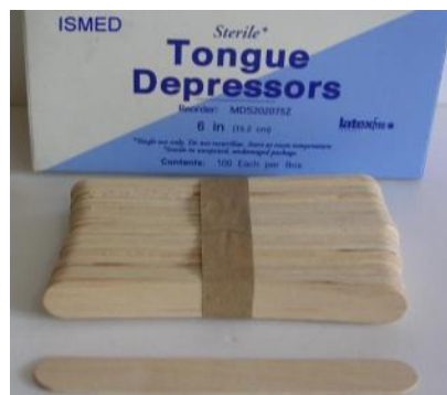
Figure 4: Disposable wooden spatulas